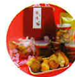
CNY Gift Box 年味礼盒