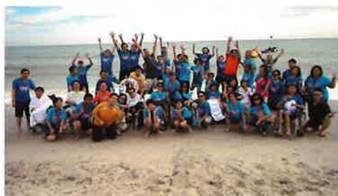
Volunteer Training Camp 志工训练营