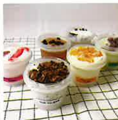
Ice Cream 冰淇淋杯