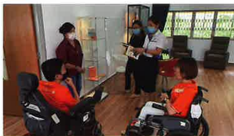
Corporate Visitation 公司企业探访