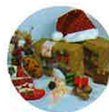
Christmas Gift Box 圣诞礼盒