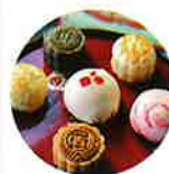
Mooncake Gift Box 中秋礼盒